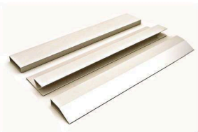
Aluminium Screeds Up to 4 m long