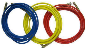
High Pressure Hose 16999-H