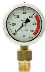
High Pressure Gauge 16999-M