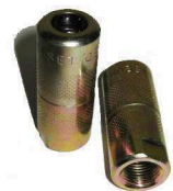
Nipple Gripper KT1042Va