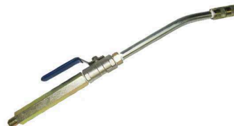
Control Valve 16999-G